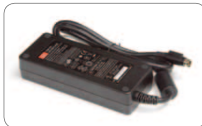
AC-DC Adaptor P.53/54