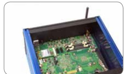
Wifi / GSM Module